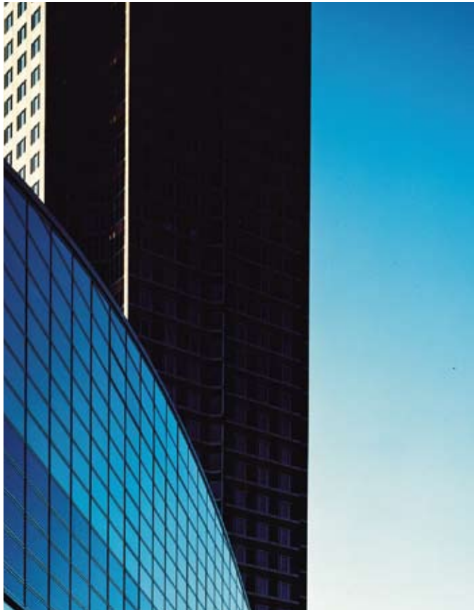
Baypren® - the brand, you can build on