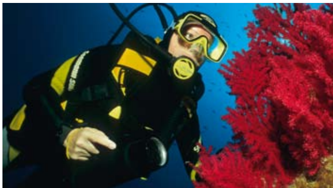
Discovering fascinating worlds with Baypren®