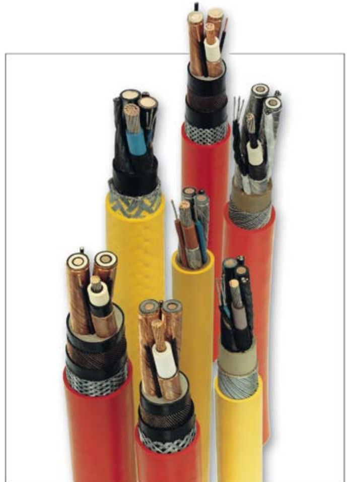
For use in dry or wet conditions – Baypren® cables and wires offer best conditions