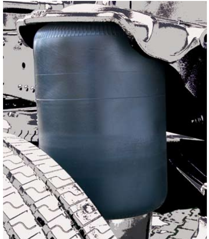
Dampers, which you can rely on