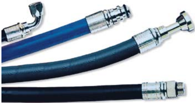
High-performance grades for high-tech hydraulic hoses