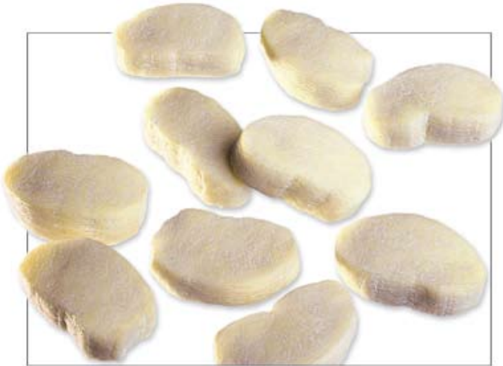
Supply forms of Baypren®: solid rubber grades

Chloroprene rubber (international abbreviation: CR) is a high-performance material with a wide diversity of applications. Along with Bayer's other synthetic rubber products, Baypren® has been produced and distributed by LANXESS AG since 2005. In April 1957, Bayer became the first company to manufacture CR in Europe when it opened its production plant in Leverkusen, Germany. Since then, in addition to making ongoing improvements to the production process and developing products to match market requirements, the company has placed special emphasis on the development of new applications for Baypren®. Process and application-oriented formulations have been developed for modern manufacturing methods and for a large number of end-uses. The formulations and the properties of the individual products have been constantly adapted to meet the more challenging requirements of today's production processes and end-users.