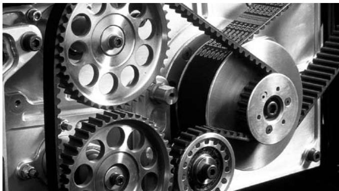
Powerfull rubber for power transmission belts