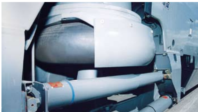
Quality-solutions, worthwhile in any case