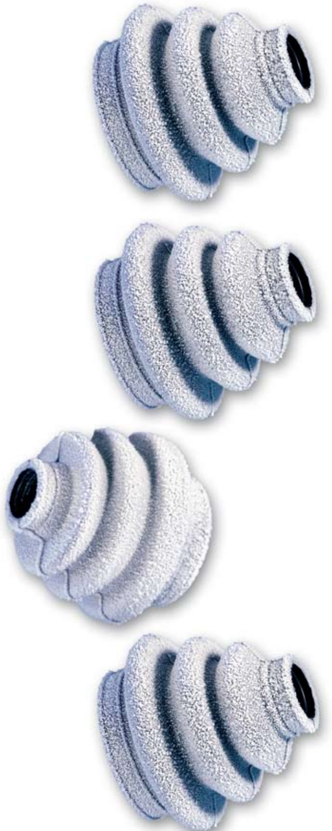
Low-temperature flexibility over long periods of time

Baypren® vulcanizates have a very low gas permeability, which is roughly equivalent to that of nitrile rubber (see comparison on opposite page).